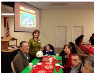
Buddies for people with sensory overload issues.

Classes and events for people with developmental disabilities.