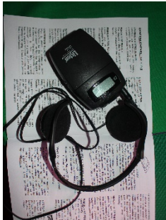
Amplified sound system for people with hearing impairments.

Classes and events for people with developmental disabilities.